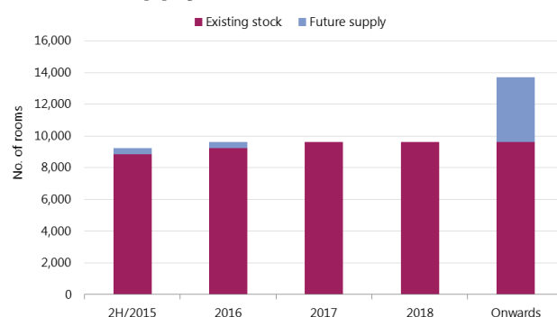
FIGURE 2 Future supply, Q3/2015 onwards