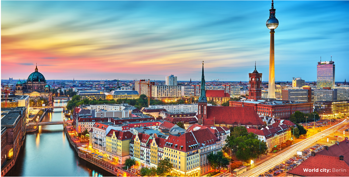
World city: Berlin